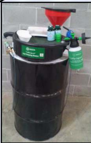
"Clean to Waste" System