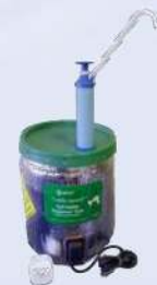
Std HEAT Tank System w/ Hand