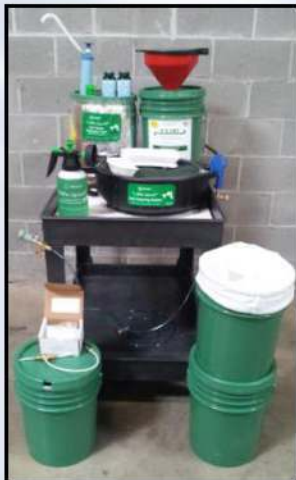
"Clean & Recycle" System

Little Squirt, Cleaning Station, Air Kit, Standard HEAT Tank System w/ Hand Pump, Clarifier Recycling System, H2O Dry Kit, & H2O Dry Funnel