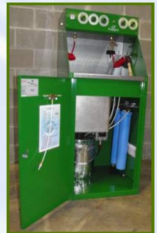
Dual Cartridge System Shown on E800A