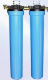
Dual Cartridge System