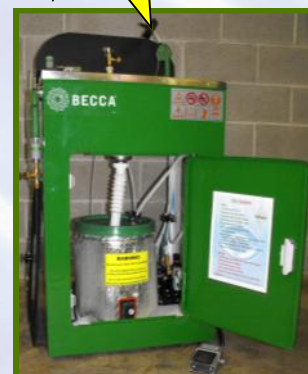
Shown on E100M

Similar to a hot water tank, this system utilizes a heat band and is programmed with a supplied timer to reach the ideal cleaning temperature. This affordable heat option is ideal for units placed outside the paint mix room. (120V @ 4.6A)