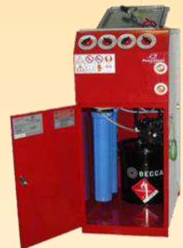
S300A shown with Optional 5 Gal Container