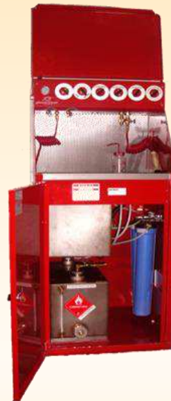
S800A Shown w/ Optional TURBO Pressure Pot & Fluid Line Cleaner, 10 Gal Tank & Cover Door