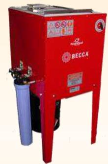
S10A shown with Optional 5 Gal Container