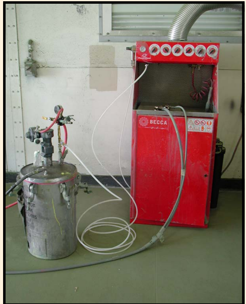
Robins Air Force Base — 30 Gal Pressure Pot System